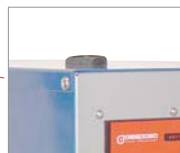
Top cap to prime the kit

IDENTIFICATION: - through PIN code or - through identification key